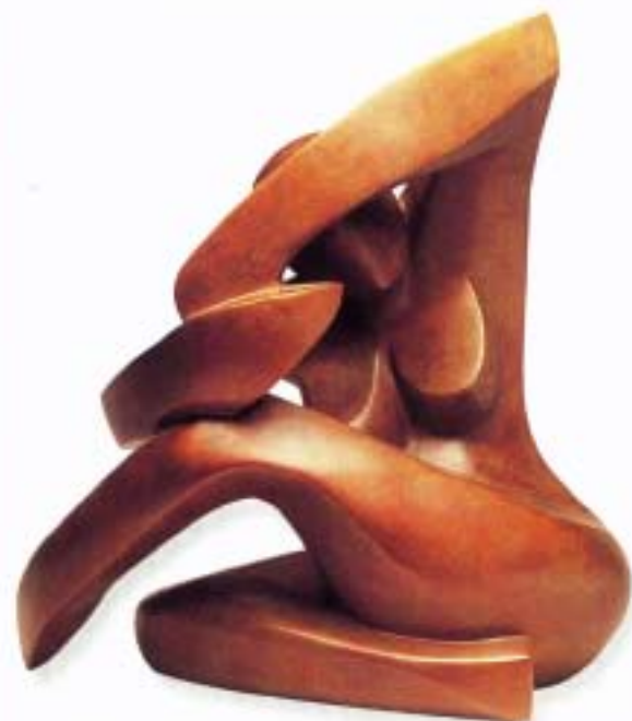
RECOIL, BRONZE, 25 X 20 X 14